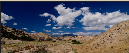
Unincorporated Open Space - Paul Lawrence