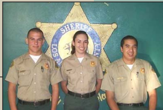
Explorer Program Graduates

provides law enforcement for patrons, employees and properties of the County, including administrative offices, parks, and health facilities.