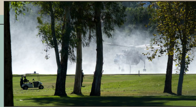
Sikorsky Helicopter landing on golf course

provides protection from structural and wild land fires, responds to emergency medical and hazardous material situations, and educates the public through the Fire Prevention Division.